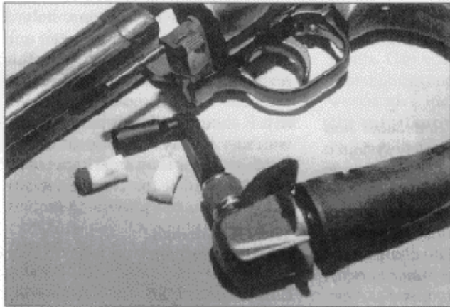
Above: The bore of this Dan Wesson .38/.357, dull with powder residue, came whistle clean and was protected against rust after using one cleaning wad and one lubrication wad.

good as far as handguns were concerned, but how about rifles and shotguns?